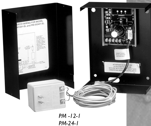
PM -12-1 PM-24-1